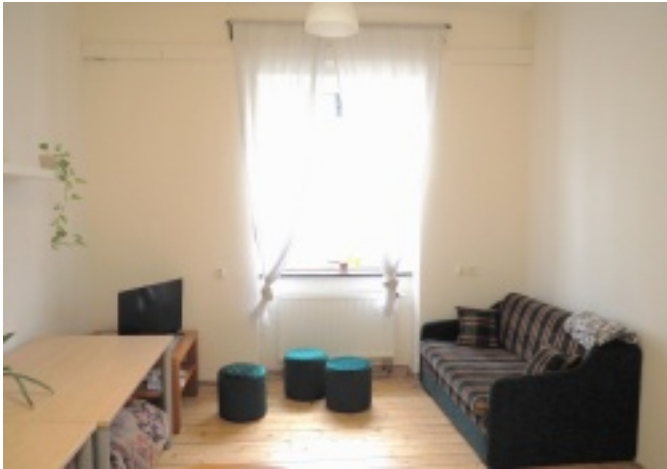
Cowork (room 204 and 206)