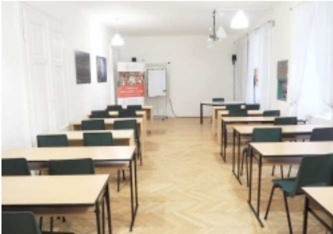
Zasedačka (room 202) and Chill-out zone (room 203)